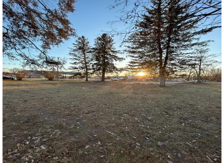
View Towards Kwik Trip