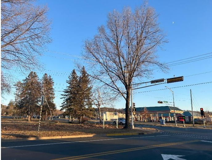
Prime Corner Location