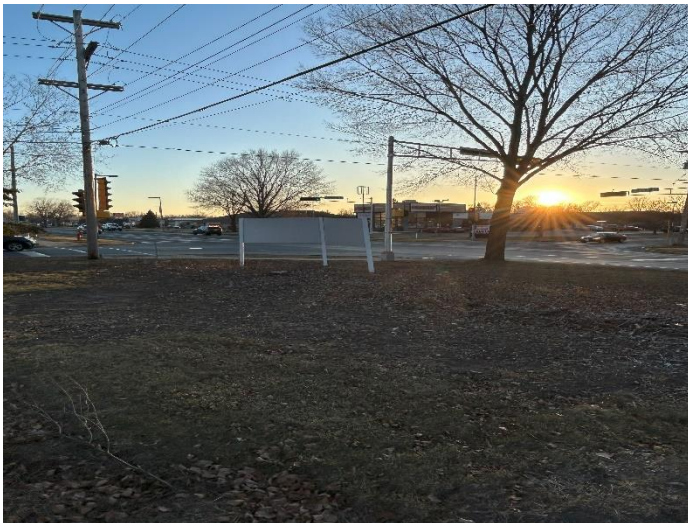
View of Intersection