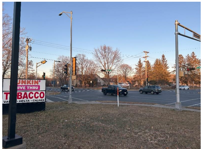
View from Dunkin Donuts